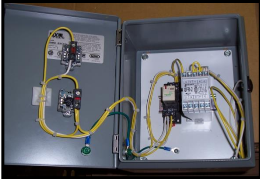
Inside of Typical Stand Alone GFI Panel